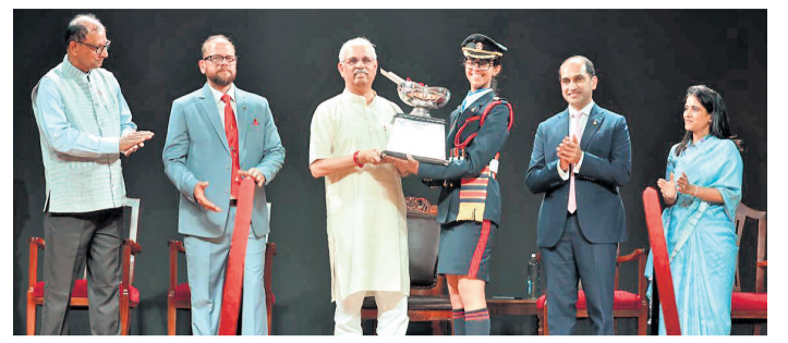
Governor Rajendra V Arlekar hands over a prize to a student at the Lawrence School at Lovedale near Ooty on Thursday