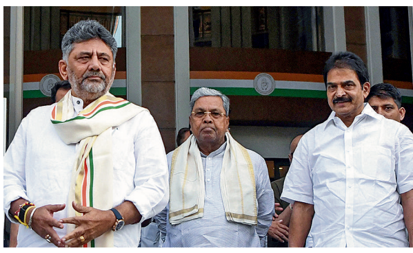
The Congress appears undecided on the Karnataka Cabinet reshuffle, and a new KPCC chief.

Whether or not Mr. Siddaramaiah agrees to be a candidate for the June 18 Rajya Sabha polls, sources close to him indicated that he is likely to announce his decision on May 28. His deputy D.K. Shivakumar has been an aspirant for the post ever since the Congress government reached